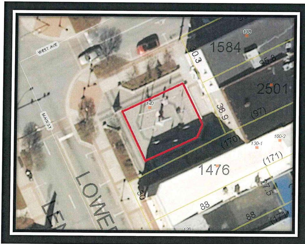
Option #2 Footprint