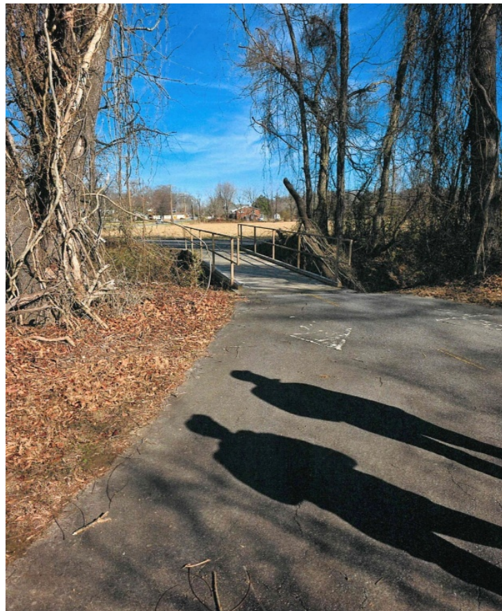
Figure 1: View at existing bridge

Perform necessary repairs to stabilize existing abutment located under the West end of the bridge, including scour protection.