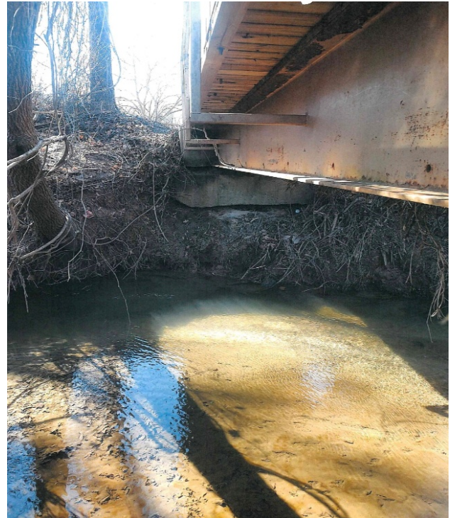
Figure 2 & 3: View at abutment requiring scour protection